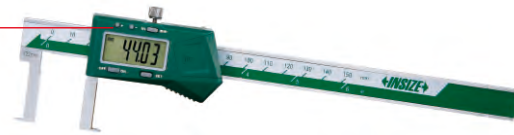
1120-150A type A