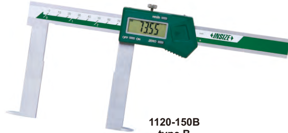
1120-150B type B